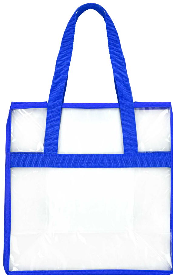
NOT TO SIZE. FOR PLACEMENT ONLY

THE DASHED LINE SHOWS THE MAXIMUM IMPRINT AREA AND DOES NOT PRINT.