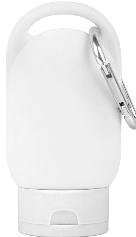
NOT TO SIZE. FOR PLACEMENT ONLY