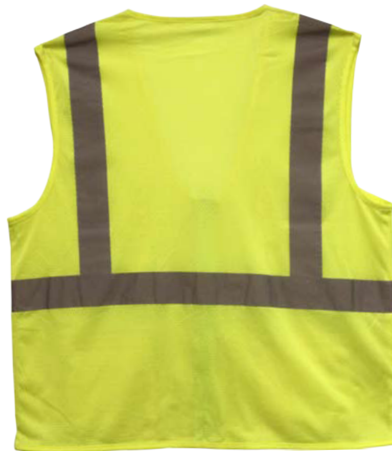
NOT TO SIZE. FOR PLACEMENT ONLY. MOCK UP VARIES DEPENDING ON SIZE OF ITEM.

THE DASHED LINE SHOWS THE MAXIMUM IMPRINT AREA AND DOES NOT PRINT.